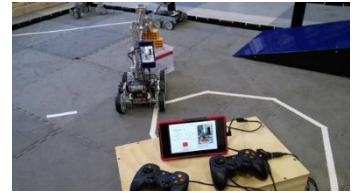
Figure 1- FIRST Tech Challenge's Android-based platform

The FIRST Tech Challenge control system uses an Android device as the primary robot controller. This system enables point-to-point wireless technology to control the robots. This document offers some basic suggestions on how to prepare for and support the wireless control system at any FIRST Tech Challenge competition.